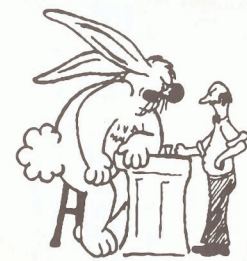
“I’m not an alcoholic—I’m a big rabbit!”

An excerpt from “A Rabbit Walks into a Bar: Best Jokes & Cartoons from AA Grapevine”